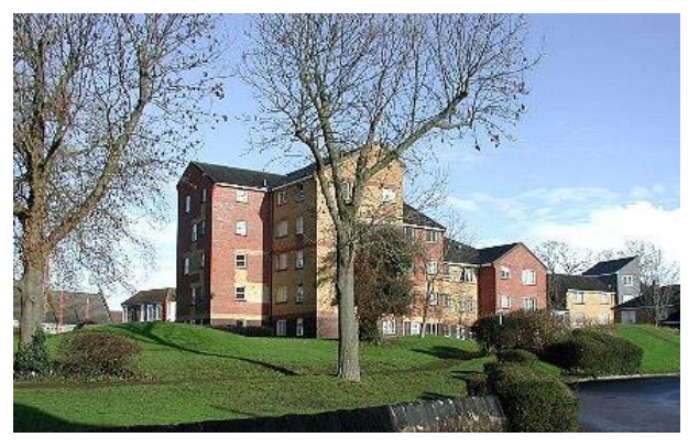
The site of St George church and churchyard which feature in Scenes now contains a residential housing development.