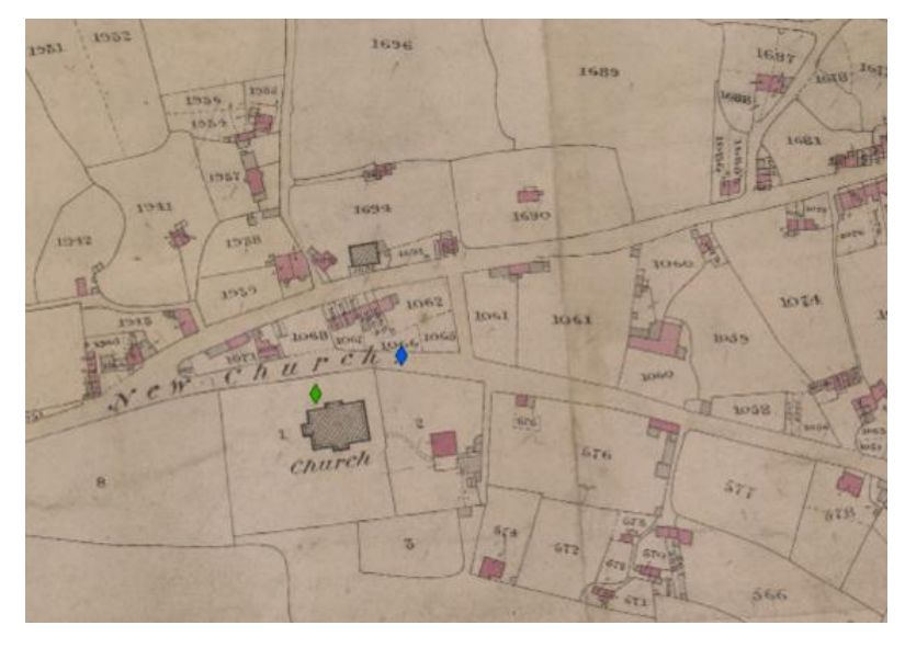
Tithe Map showing St George in 1840s. Click to view Bristol City Council mapping system.

Although women were prolific writers, Dresser highlights that "to publish your work, was to flaunt yourself". Emra therefore "must have been a bit of a pioneer" through her writing.