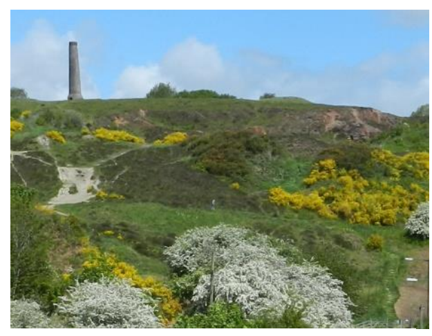
Descriptions of Troopers Hill in St George feature throughout Scenes.

The second collection Realities of Life was published in 1838, and mentions St George throughout.