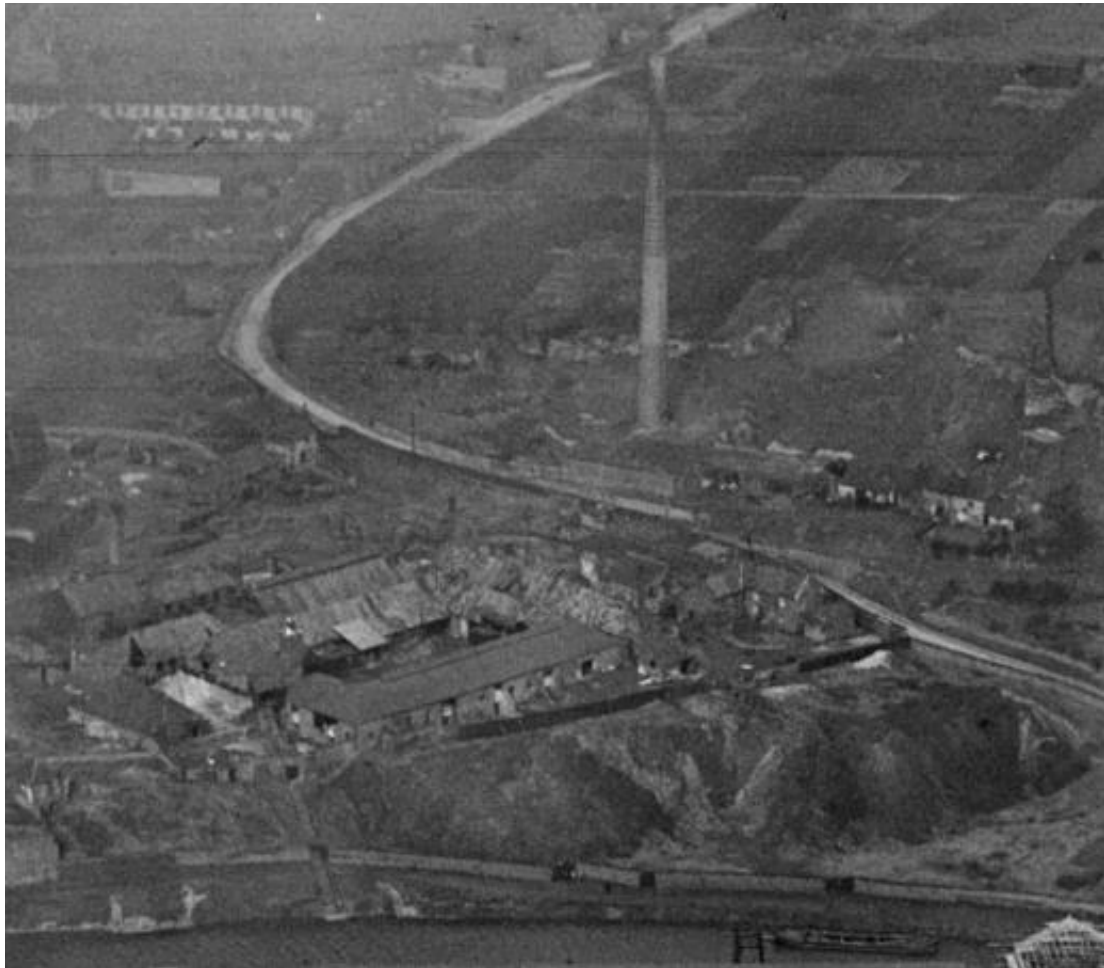
Blackswarth Leadworks and chimney, 1921 – image from the Britain from Above website .